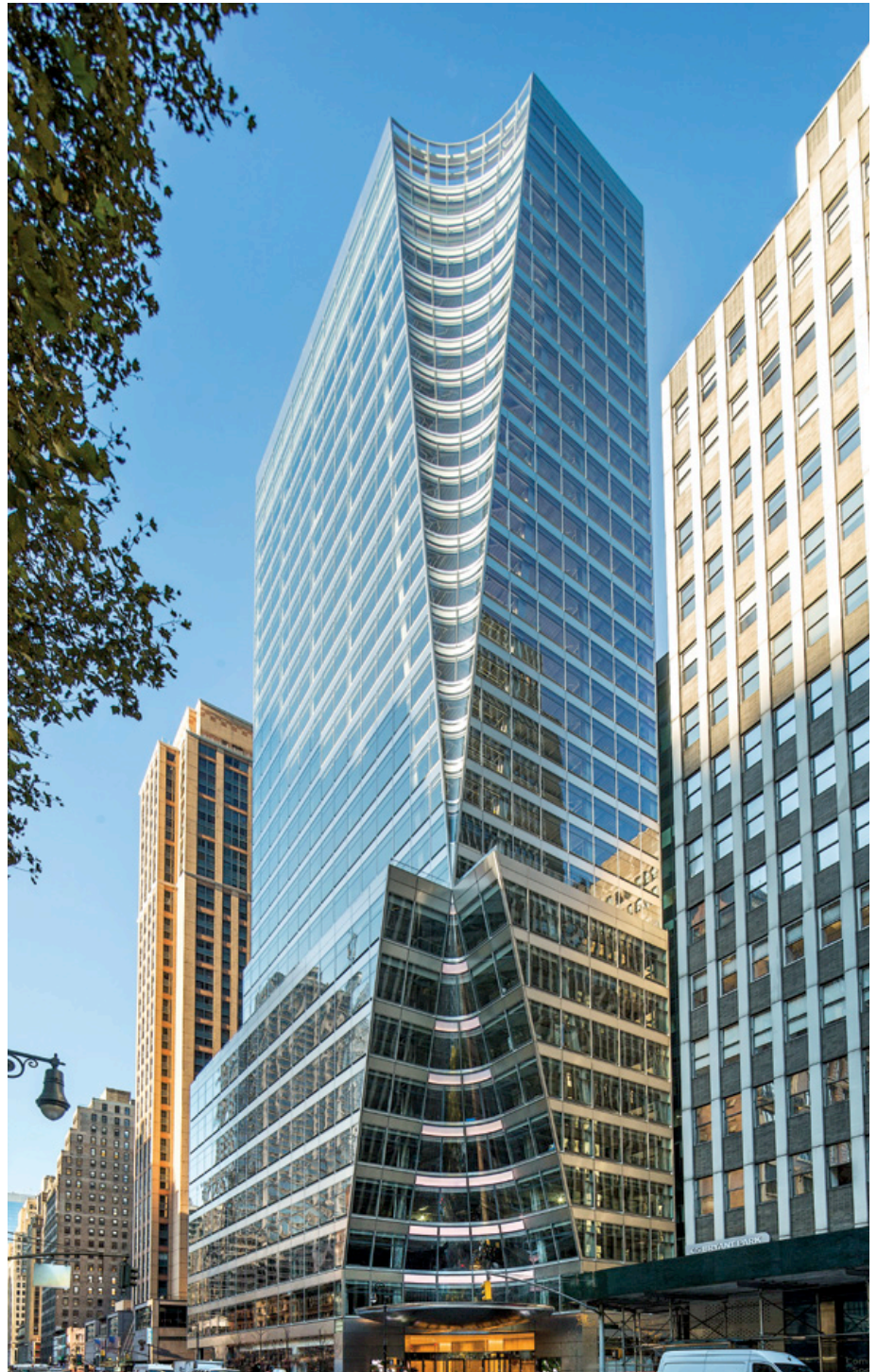
The conical incisions carved out of 7 Bryant Park are complemented by stainless steel spandrels and highly transparent Vitro Architectural Glass

However, the project's complex specifications and lofty sustainability goals created an opportunity for the Vitro Concierge Program™ to help the glass fabricator and curtain wall contractor complete the project on time, according to specifications and with optimal aesthetic quality.